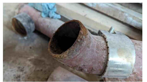
Corrosion had left the pipe ends uneven, making it impossible to create watertight joints using clamps

Pipe joints in a 250-metre-long internal cast iron rainwater stack are sealed, avoiding a total system replacement during the refurbishment of an office block