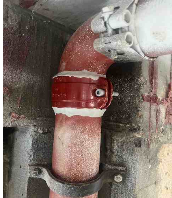
120kg of AB Original was used to seal 300 joints in the rainwater stack before it was blocked back off