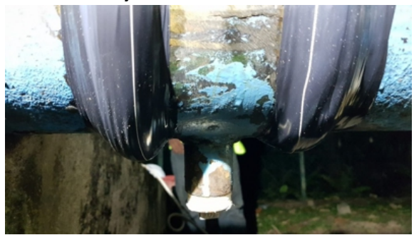
Once the ends of the joint had been encapsulated, Wrap & Seal was applied directly over the leak area to create a ridge increasing the pressure resistance of the repair