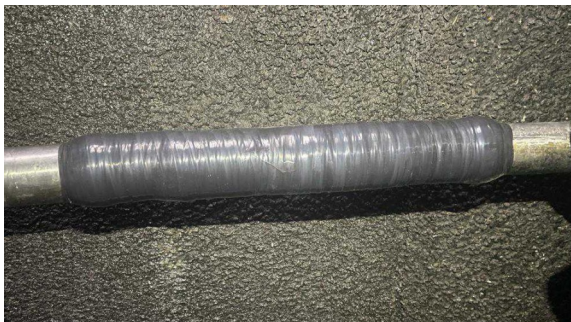
Wrap & Seal was applied along the entire 600mm length of the area which had been patch welded