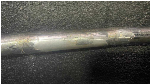
An initial repair attempt involving patch welding failed, leaving multiple pinhole leaks in the pipe