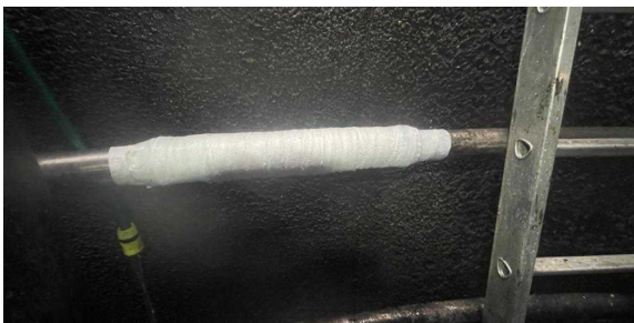
SylWrap HD Bandage encompassed the repair with a rock hard shield to protect against future impact from the pillar and mixer blade