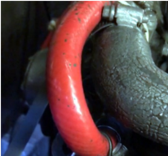
The pinhole was on a section of red coloured rubber pipe where access was severely restricted

The boat owner contacted Sylmasta seeking a versatile repair method capable of being effective despite the inaccessibility of the hose. A SylWrap Standard Pipe Repair Kit was sent to the boat.