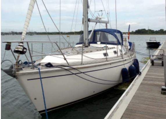
The boat could not sail safely whilst the hose leaked

A rubber hose connected to a boat engine undergoes repair after developing a pinhole leak in an area of the vessel which was extremely difficult to access