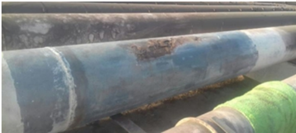
The 2 metre long section of steel pipe to be reinforced, with the 600mm patch of heavy corrosion in the middle

An industrial site in Saudi Arabia rebuild and reinforce 2 metres of steel pipe before heavy external surface corrosion could eat through and breach the line