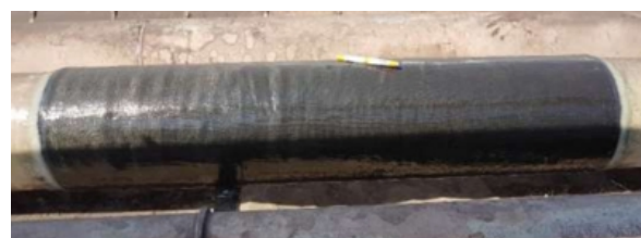
SylWrap CR was applied to a 2 metre section of the line, centred around the corroded area rebuilt using Sylmasta AB. The corrosion inhibitors in SylWrap CR provided greater protection in such an aggressive environment, compared to SylWrap HD

Reinforcing the line took around half a day. There was no disruption to production on site as the line remained in full operation throughout.