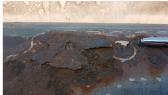
Closer inspection of the corroded area showed how much external surface damage the pipe had suffered

When this happened, the line would have to be shut off for either a leak repair or a replacement section to be fitted. To avoid this costly and disruptive process, the site decided to rebuild and strengthen the pipe before it failed.